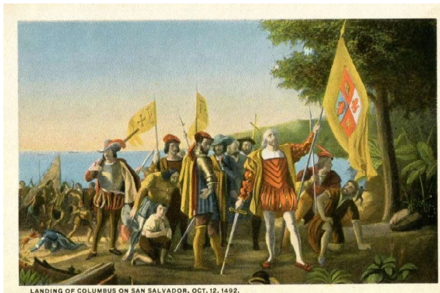
LANDING OF COLUMBUS ON SAN SALVADOR, OCT. 12, 1492.