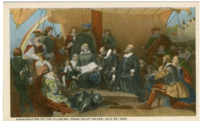
EMBARKATION OF THE PILGRIMS, FROM DELFT HAVEN, JULY 22, 1620.

"The only thing necessary for the triumph of evil is for good men to do nothing."